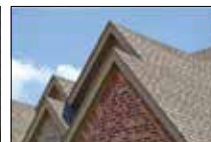
Roof Replacement & Insurance Claims