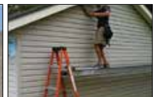
Vinyl & Cement Board Siding