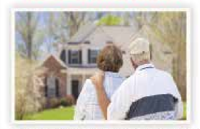
Tuesday, November 13 • 9:30 to 11:00 AM Southglenn Library • 6972 S. Vine Street

Learn valuable insights on navigating an estate sale from the trusted estate liquidation consultants at Google Down and explore the various senior buying options Denver has to offer.