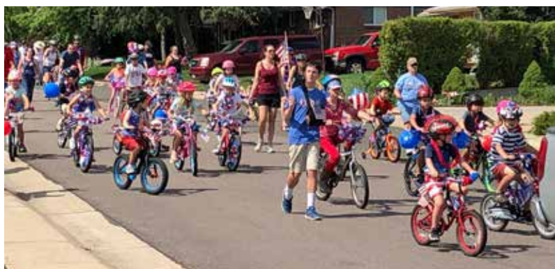
We had great participation at this year's Fourth of July Bike Parade!

The Active at Any Age Summer catalog is now available online and at any South Suburban Parks and Recreation facility. Some of the trips planned for August include: Leadville Scenic Train Trip, Applewood Seed Company, Barr Lake State Park Hike, Lake Dillon Boat Tour. There are trips in September that have an August RSVP deadline such as: Day in Cripple Creek, Beauty and the Beast, Broomfield Veterans Memorial Museum. For more information, please call the Active Adult Programs Coordinator or the Trips and Tours Coordinator at 303-730-4606.