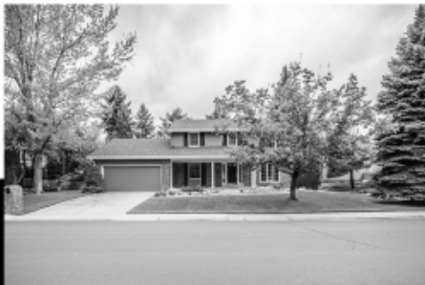
3246 E. Easter Place SOLD 100% of asking price FOUR days on market