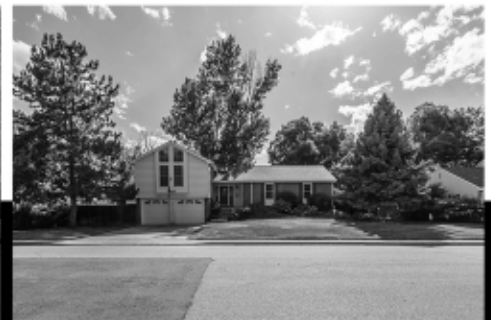
6807 S. Elizabeth Street SOLD 99% of asking price SIX days on market

When the time comes for you to move, partner with proven area experts who go the extra mile to ensure your home sells quickly & for top dollar.