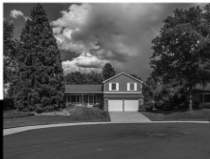
7176 S. Willow Street SOLD 100% of asking price THREE days on market